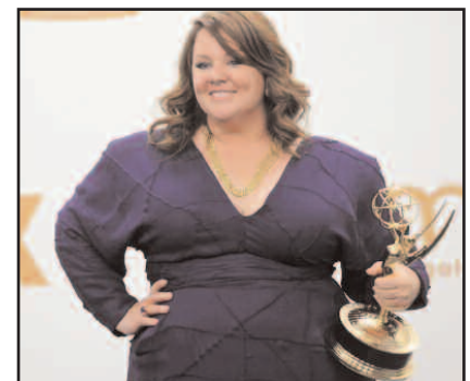
Melissa McCarthy was proud of her Emmy win and the fact that she made her own dress for the awards ceremony.

Fans can also catch her on the big screen again in December 2012 in "This Is Forty," a spin-off of the film "Knocked Up," with Megan Fox, Paul Rudd and John Lithgow.